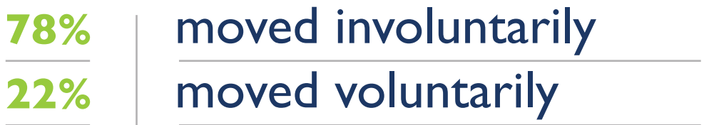
Figure 2: For New Majority teachers who moved in their first two years...

When teachers make a voluntary choice to leave a school, there are a number of factors that contribute to their decision to leave. More than half of all the teachers who responded had made at least one voluntary transition at some point during their careers. These transitions took place both within and outside of IPS.